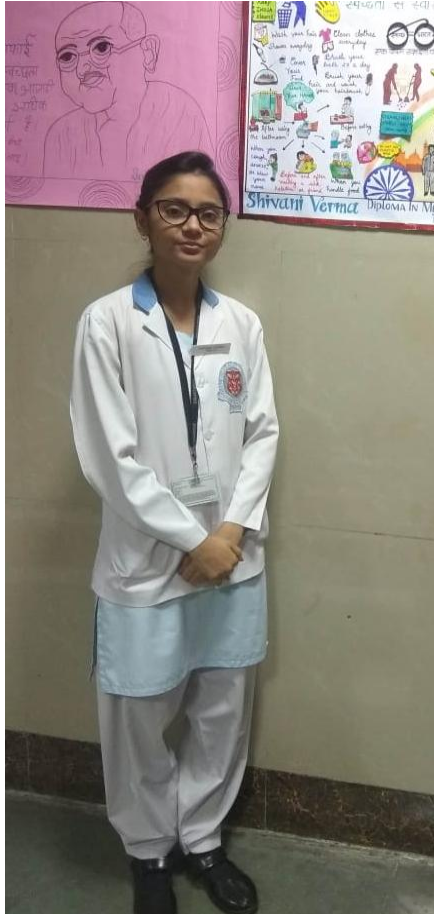
Female dress code