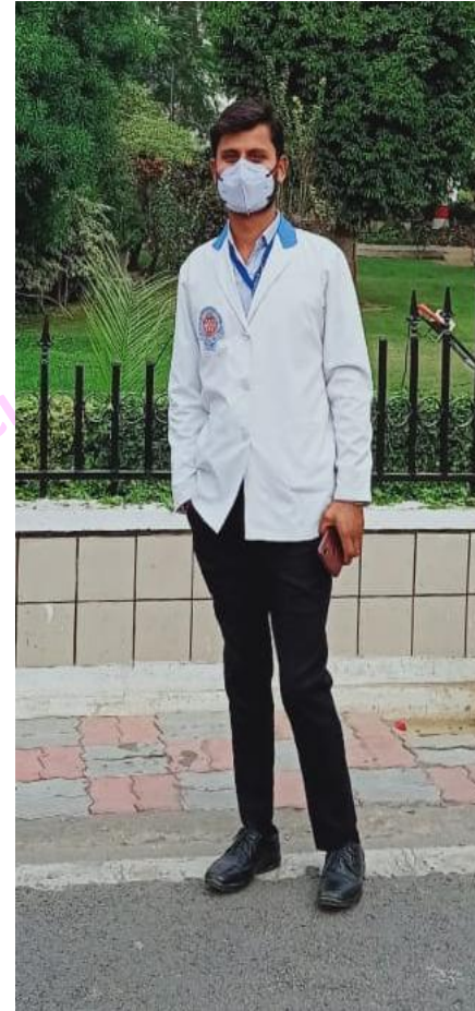
Male Dress Code