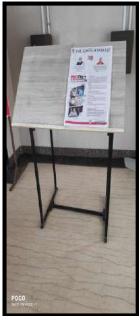
News paper reading