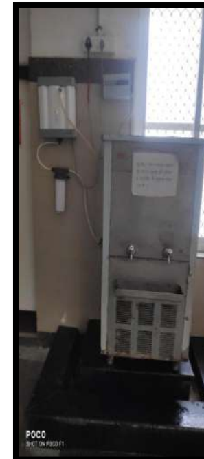
Drinking water facility