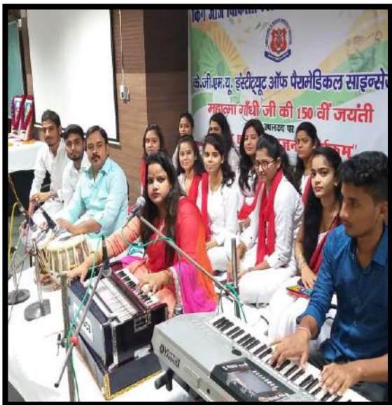
Music class facility