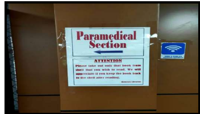
Paramedical library section with wifi