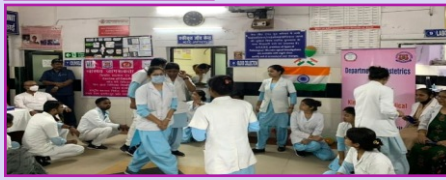
Nukad Natak organised by nursing staff