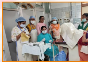
Training for screening and treatment of Cervical Cancer and treatment of Cervical precancer