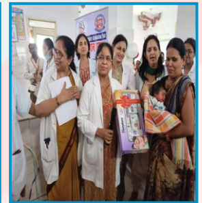
Healthy baby show