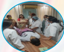
PPH training of nursing staff