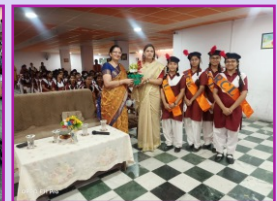
Adolescent health awareness activity