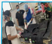
PPH training of helping staff