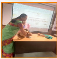
RRTC Training of trainers through UPTSU

Initiative by Department of Obstetrics n Gynaecology to improve health care in state by strengthening referral facility (PPH EmCare Referral group)