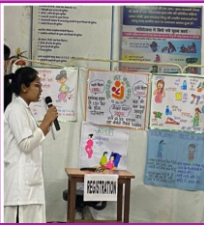
Poster competition (by undergraduates)