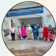
FIGO MGIMS visit in May 2022