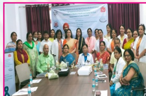
Training for screening and treatment of Cervical Cancer and treatment of Cervical precancer- CHAI Foundation Initiative