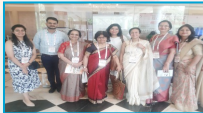
ISOPARB 2022 Varanasi