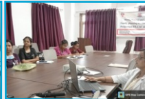
Medical abortion training of Postgraduates