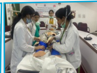
PPH training simulations of Postgraduates