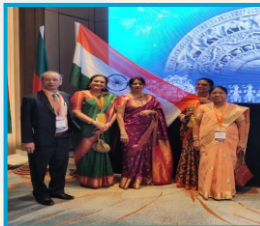
Silver Jubilee SAFOG, Sri Lanka