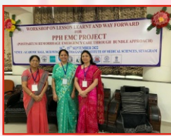
Delegates from FIGO, Bangladesh on 15.09.2022