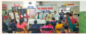
World Population Day 2022 11.07.2022