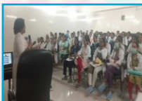
Biomedical waste management training