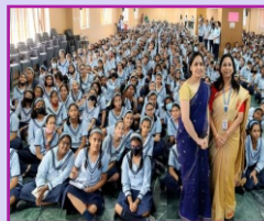
Menstrual awareness activity