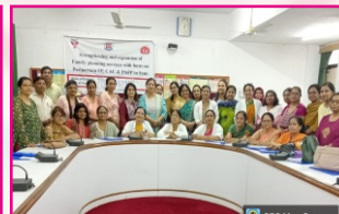
LAP training of MOs