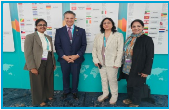
IGCS 2022 New York