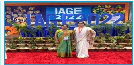
IAGE 2022 Kolkata