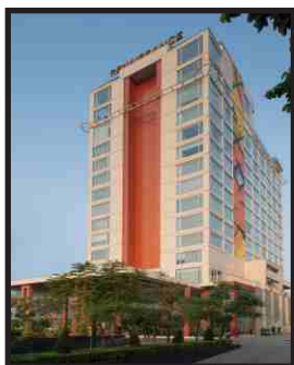
Hotel Renaissance Vipin Khand, Gomti Nagar, Lucknow