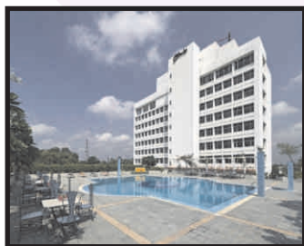
Hotel Clarks Awadh Hazratganj, Lucknow