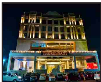
Hotel The Regnant Nirala Nagar, Lucknow