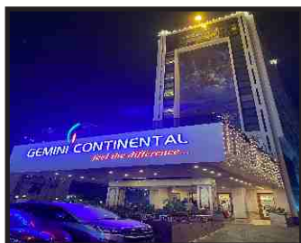
Hotel Gemini Continental Hazratganj, Lucknow